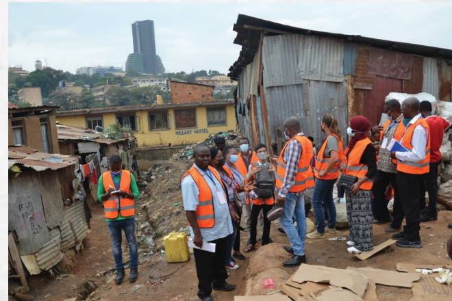
Picture: Rotary Peace Fellows during the study visit to Kampala Urban Slums

Cohort 3 Peace Fellows had their urban field visits to; Cultural Institutions and local peace approaches; visit to the Urban slums and studying the causes of the urban crimes in Kampala; the urban refugee crisis; youth and the role of religion in Peace building. Their study visits to the Interreligious Council explored a deeper understanding on the use of dialogue in solving conflict especially in indigenous communities.