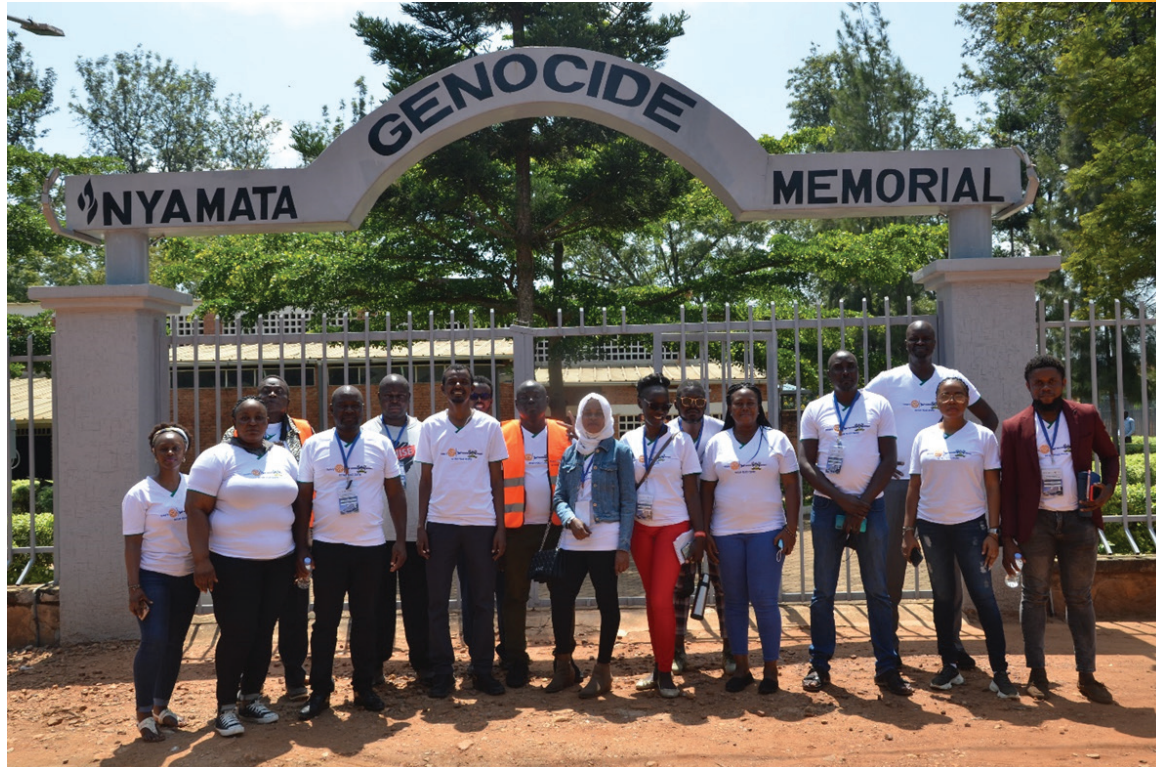
Picture: Cohort 3 Rotary Peace Fellows while on a study visit to Nyamata Genocide Memorial site in Rwanda