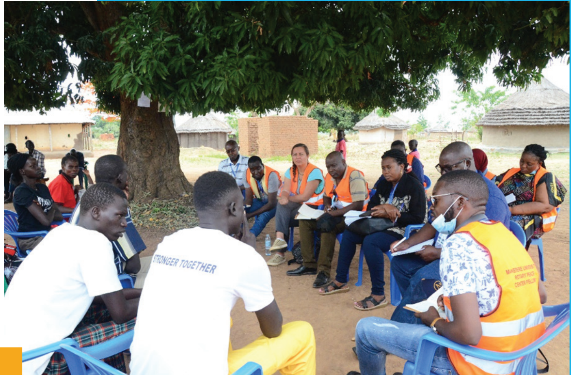
Picture: Rotary Peace Fellows speak to the Refugees from South Sudan in Adjumani

The fellows explored and studied the Post-conflict era in the North-western part of Uganda, highlighting the effects of the Lords' Resistance Army on lives of victims and ex-combatants; visited the Landslide affected area in Eastern Uganda and also studied the climate change on the environment and advance causes of natural resource conflict.