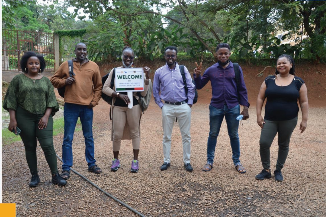
Picture: Some of the fellows pose with their host counselors upon arrival to Uganda

The Center received Cohort 3 Peace fellows. The fellows come from 17 countries. These Countries include; Myanmar, Kenya, Sudan, Nigeria, Cameroon, Zambia, Australia/South Sudan, Sierra Leone, Mozambique, USA, Germany, Ghana, Zimbabwe, Somali Land, Ethiopia, Liberia and Uganda.