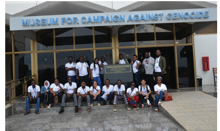
Picture: While in Kigali, the fellows also visited the Museum for Campaign Against Genocide

Earlier this month (April), the fellows had a study visit to Kigali-Rwanda, to explore on the post genocide era of Rwanda.