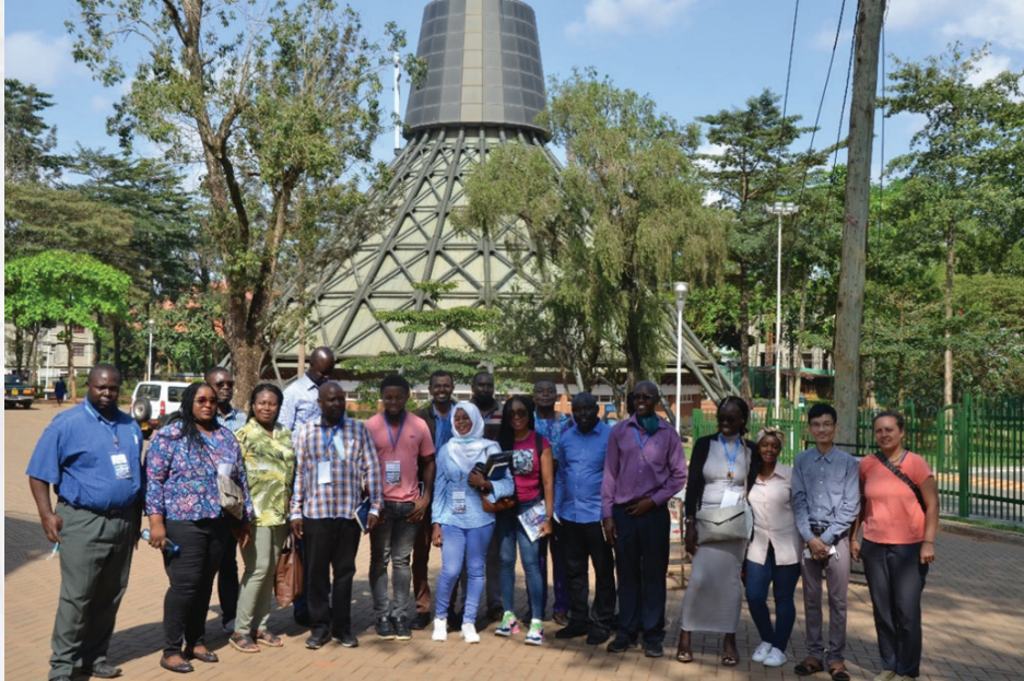
Picture: Rotary Peace Fellows during the study visit to Uganda Martyrs' Catholic Shrine